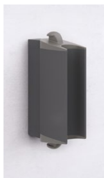
A broad range of fixture options

Designer awnings by markilux. Made in Germany. Create the most alluring shade in the world.